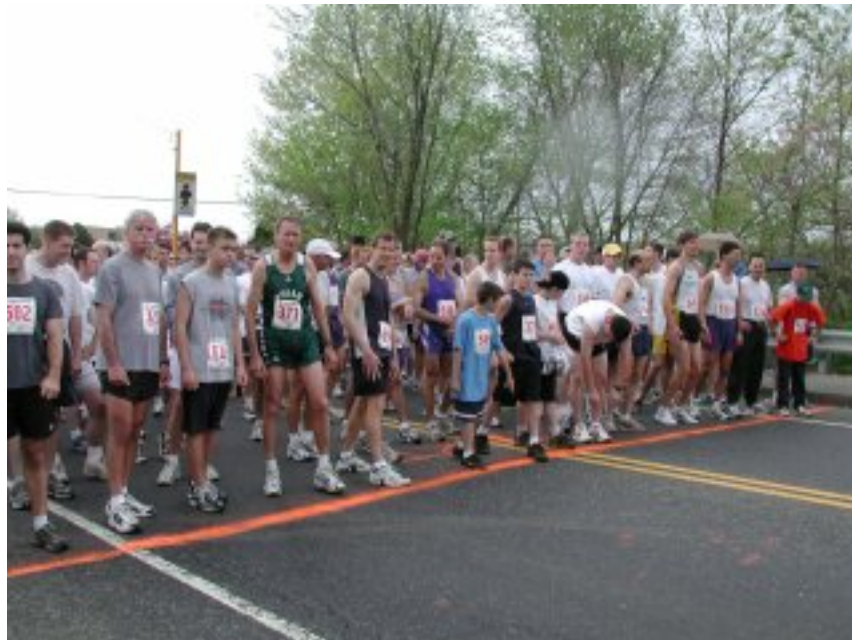
Start of Grafton Gazebo Road Race - 2002