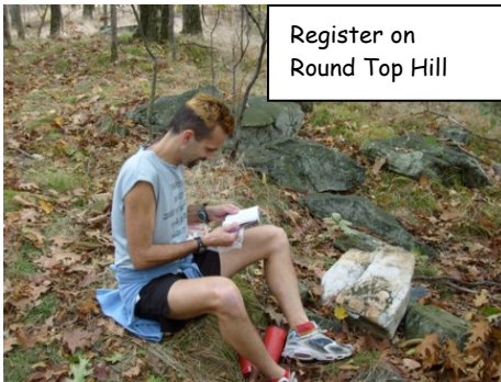
Register on Round Top Hill

Spring hikes - Nutting hill & Holt Hill 03-23. Great Blue Hill 04-01.