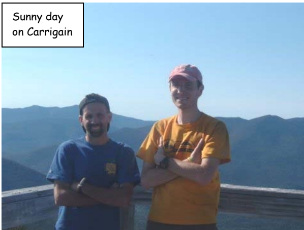
Sunny day on Carrigain

Whiteface, E. Sleeper, W. Sleeper, The Tripyramids, Fool killer, Scaur 10-20. Kelsey & Dixville 10-21. Mt Agamenticus 11-08. Oak hill, Nottingham, Copple crown mtn, Stratham hill 11-09. Belknap Traverse (12 mountains) 11-12. Sunrise hill, Bellevue hill 11-17. West mountain & Crum 11-24.